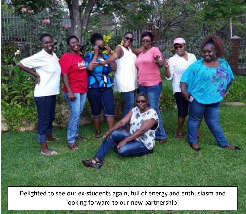
Delighted to see our ex-students again, full of energy and enthusiasm and looking forward to our new partnership!

This is an exciting new development and we are so pleased to be able to join with ex pupils both in the UK and Zimbabwe to continue supporting the school in whatever way we are able.